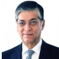
Ilam C Camboj